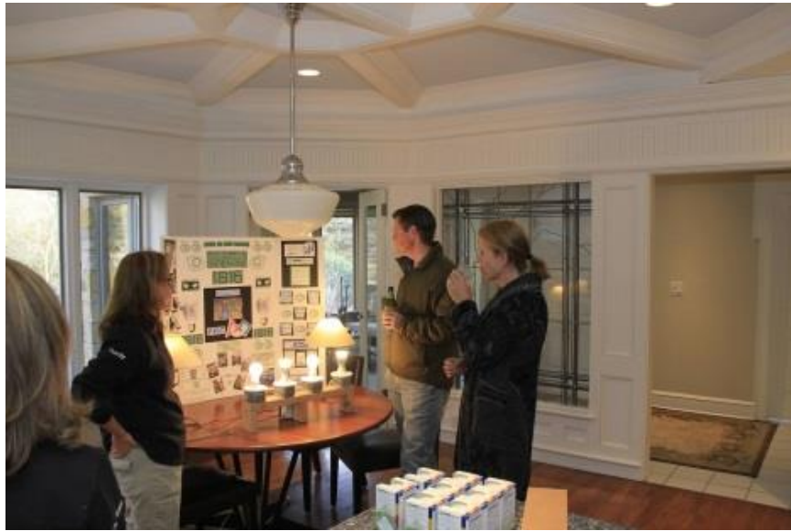
(Guests next to LED Board)