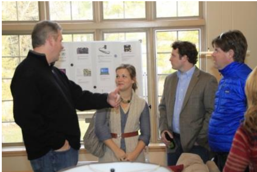
(Guests standing by Wish List Board)