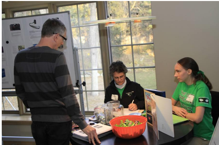
(2013 House Party Guest Making a Donation)