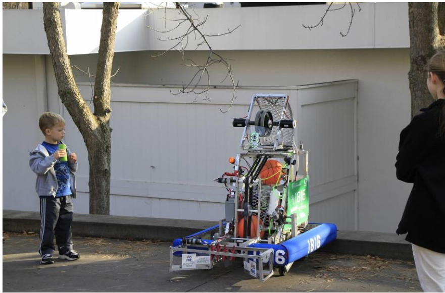
(2013 House Party Zephyr and Admirer)