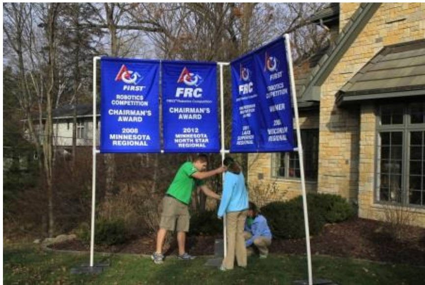
(Setting up Team Banners outside the 'house' for the Open House)